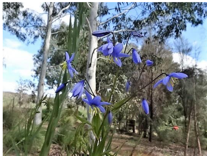
Stypandra glauca Nodding Blue Lily. A hardy perennial species that is related to Dianella.