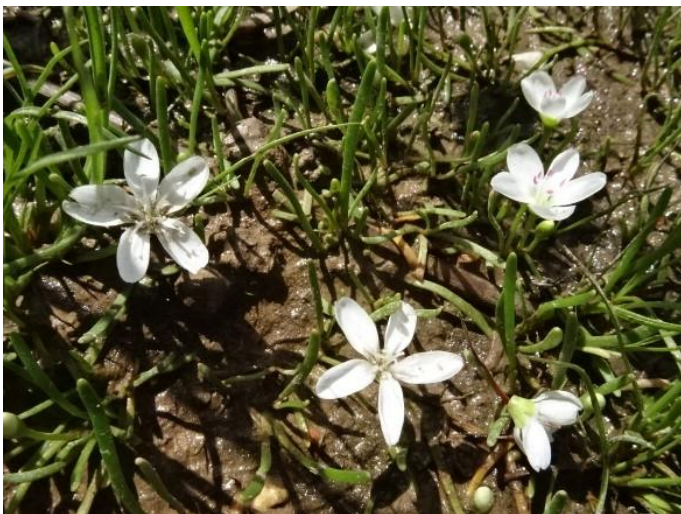
Neopaxia australasica White Purslane. Another species thriving on the edge of the ephemeral wetland