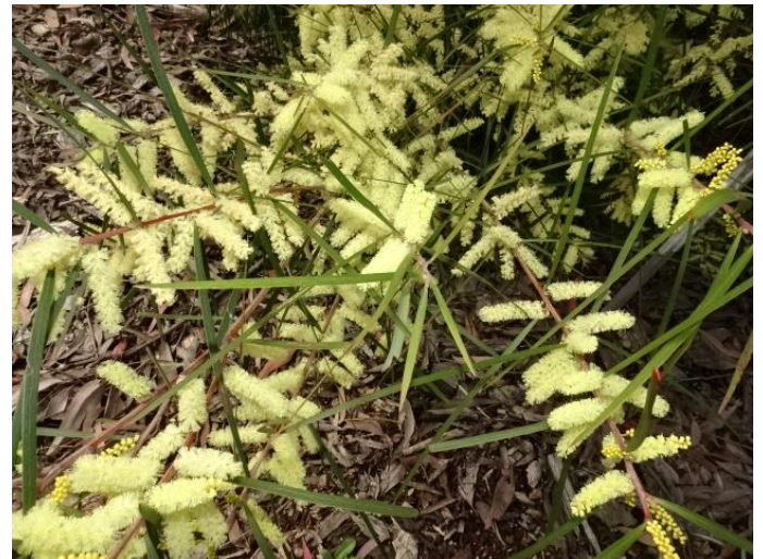
Acacia floribunda White Sally or Gossamer Wattle. May be a self-seeded plant as it is not in our records.