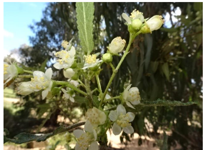
Gynatrix pulchella Hempbush. An open medium sized dioecious shrub found in local reserves.