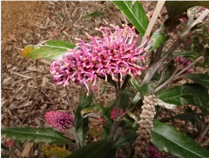
Grevillea wilkinsonii Tumut Grevillea. . A very rare species of the southern tablelands.