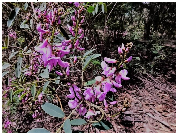
Indigofera australis Austral Indigo. An upright open hardy shrub that is quite common locally.