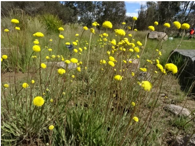
Craspedia variabilis Billy Buttons. These seem to have appreciated the damp conditions this season.