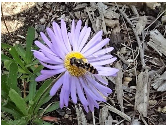
Brachyscome spathulata Spoon-leaved Daisy with Melangyna viridiceps Common Hoverfly.