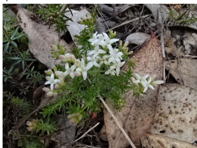
Asperula conferta Common Woodruff. A low perennial shrub, woody at its base. Widespread in eastern Aust.

We are enjoying having increased numbers of visitors. Small sections of path are still blocked off. Our working bees are each Thursday morning from 8am. Morning tea (byo) is at 10am at the tables or at the shed. Tools are supplied. New volunteers are welcome, just turn up and make yourself known.