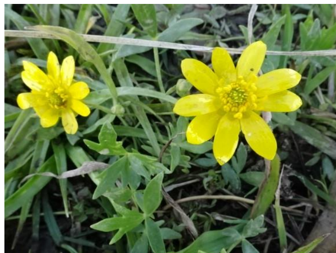
Ranunculus papulentus Large River Buttercup. This species favours wet areas.