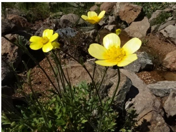
Ranunculus lappaceus Common Buttercup. A widespread perennial of the eastern states.